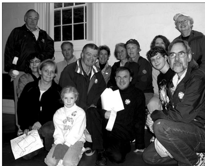
The CROPWalk team from St. Peter's Episcopal Church assembles just before CROPWalk 2006 begins.